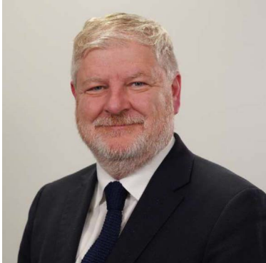
Angus Robertson MSP

I hope the proposals in this paper, covering issues such as core internationalist values, international relations and defence policy will help stimulate debate over the kind of country we aspire to be, and I look forward to engaging with as many people as possible as we discuss Scotland's future.