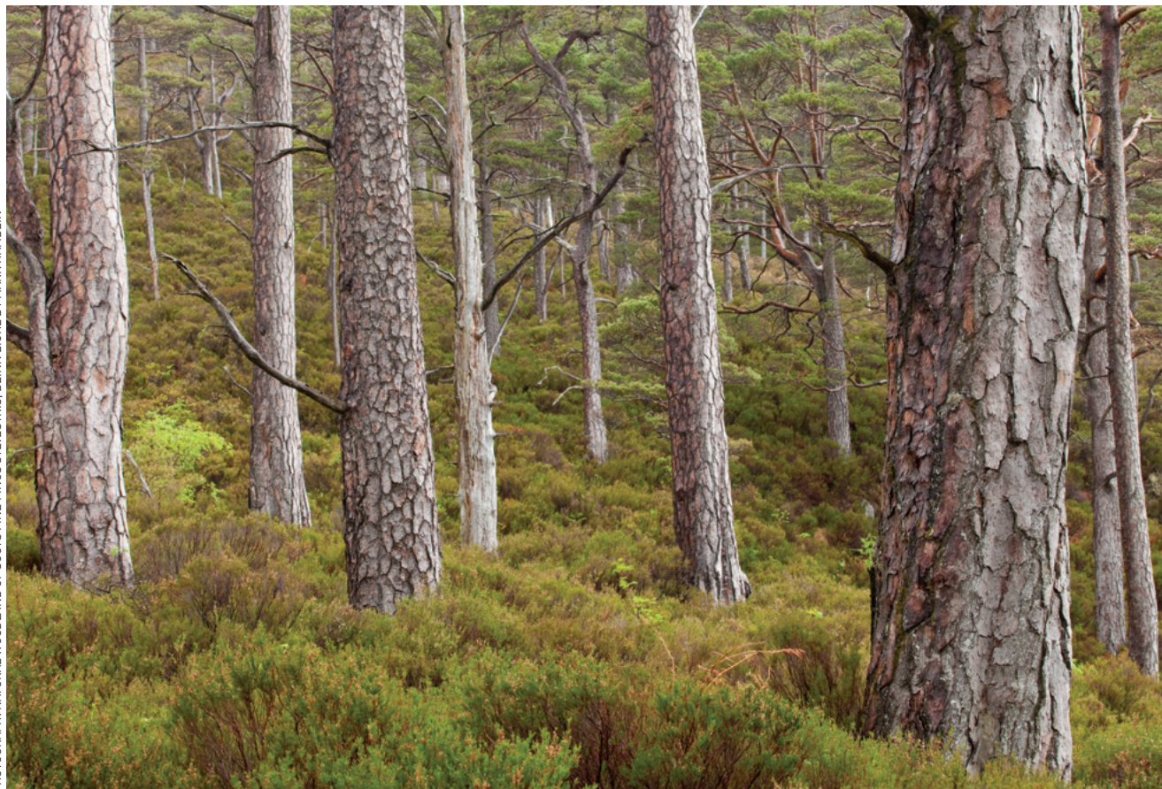
PHOTOGRAPH: NATURAL WOODLAND OF SCOTS PINE PINUS SYLVESTRIS, BEINN EIGHE BY MARK HAMELIN

Better deer management will increase natural woodland cover, soak up carbon and reduce flooding